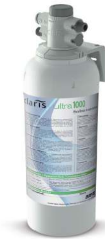
Head sold separately.

Claris Ultra 1000-L Filter Cartridge: EV4339-82